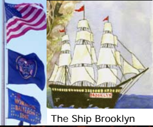
The Ship Brooklyn