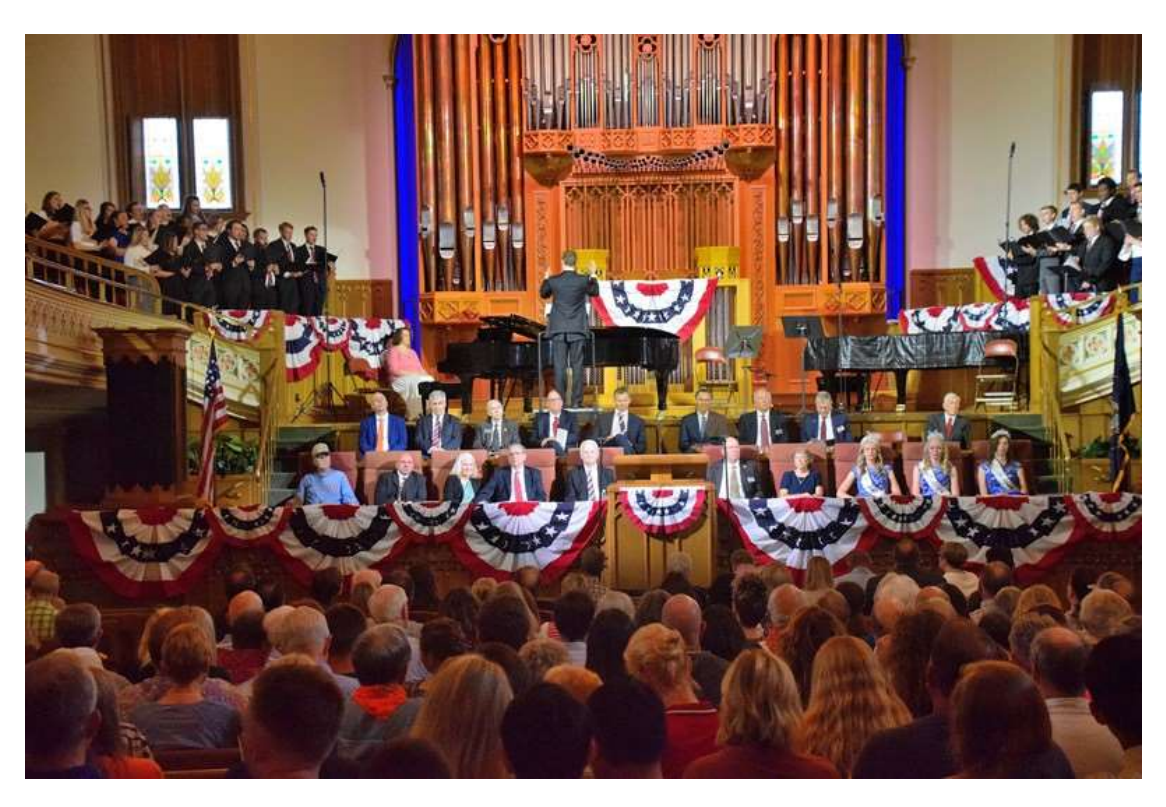
Pioneer Day Sunrise Program In Assembly All On Temple Square