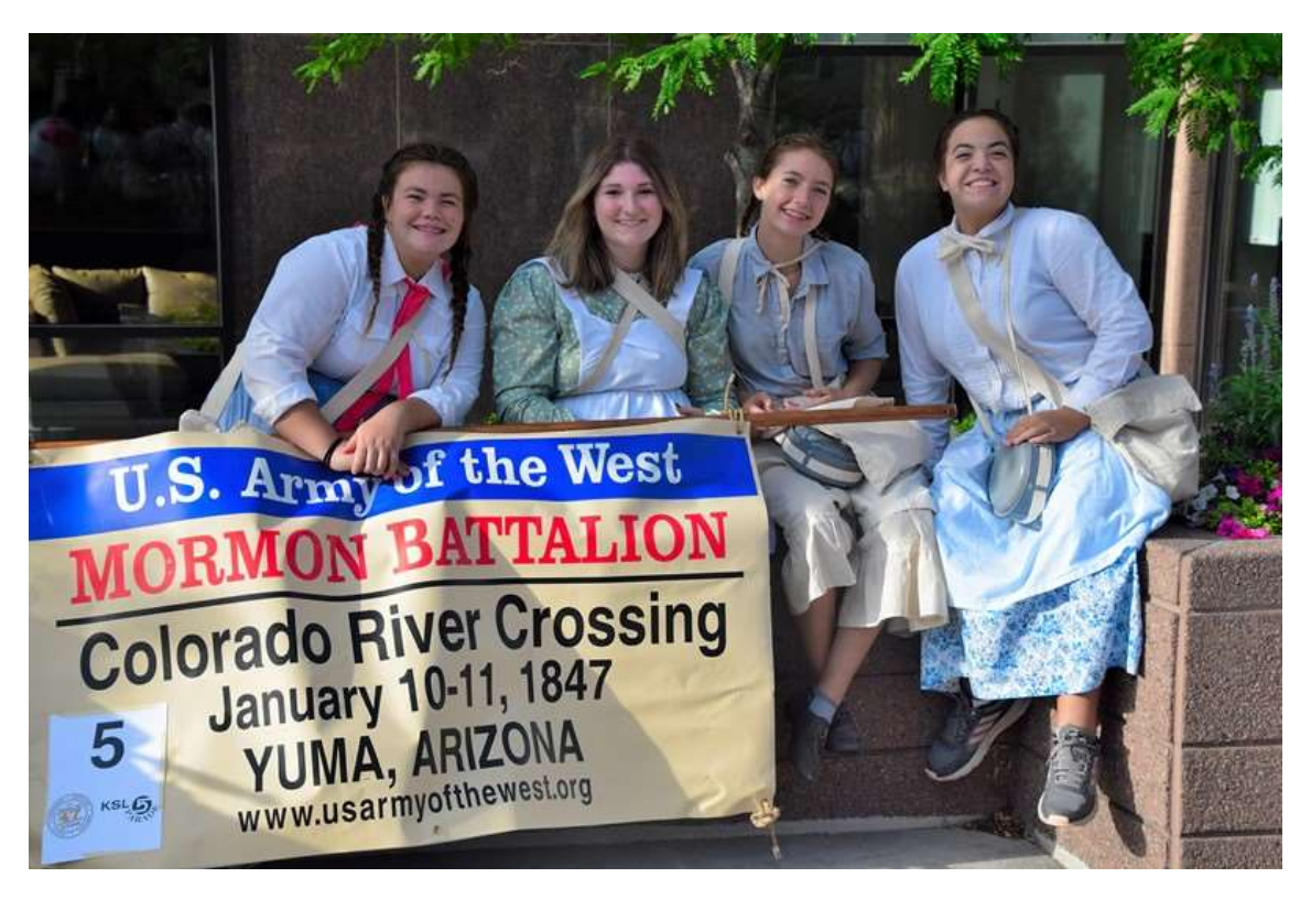
U.S Army of the West Ladies Parade Participants from Yuma, AZ