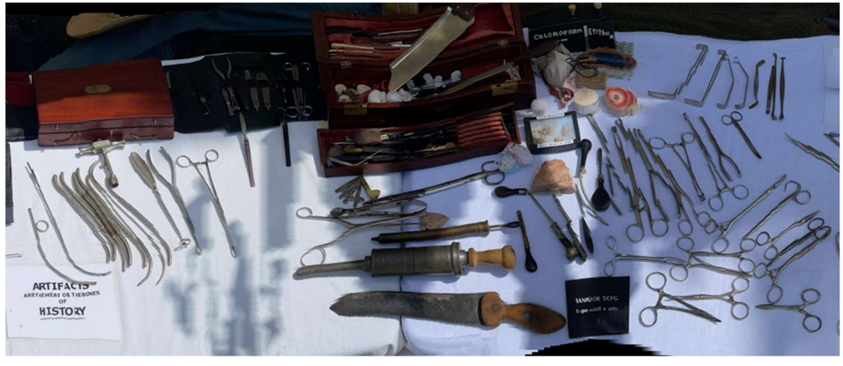
Medical Display by a Physician