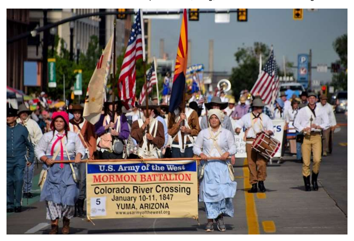
U.S. Army of the West (Yuma, AZ) and MBA Members Marching in the Pioneer Day Parade.