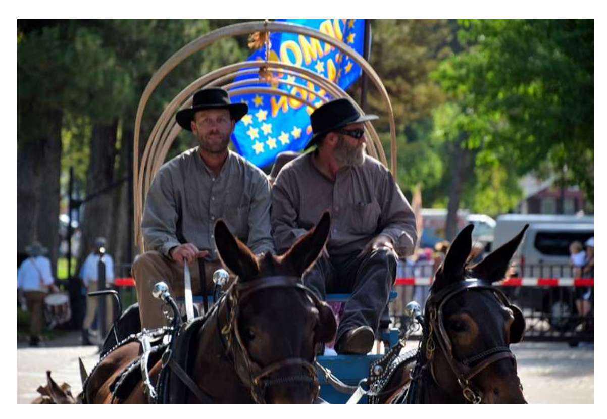
Mormon Battalion Teamsters at End of the Parade.