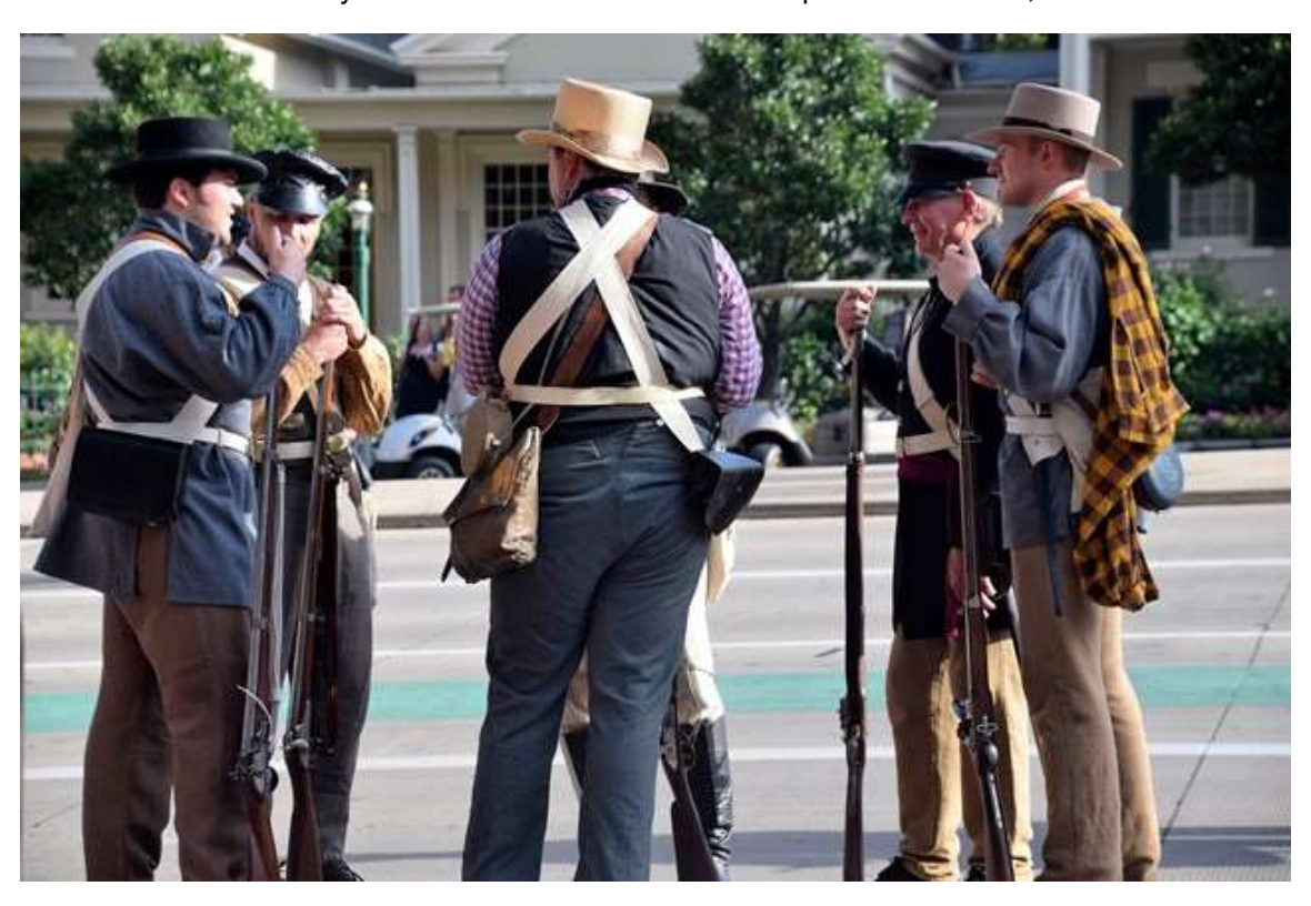
U.S Army Of The West Parade Participants Preparing To March In The Pioneer Day Parade