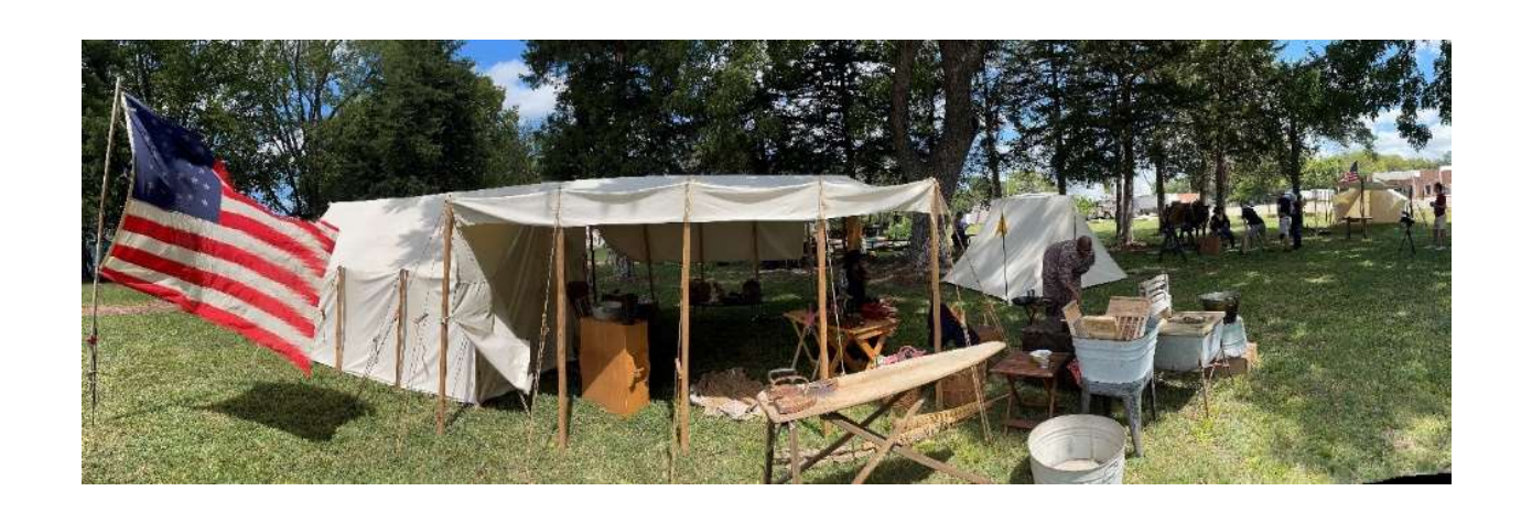
Buffalo Soldiers camp with the Laundress set up.