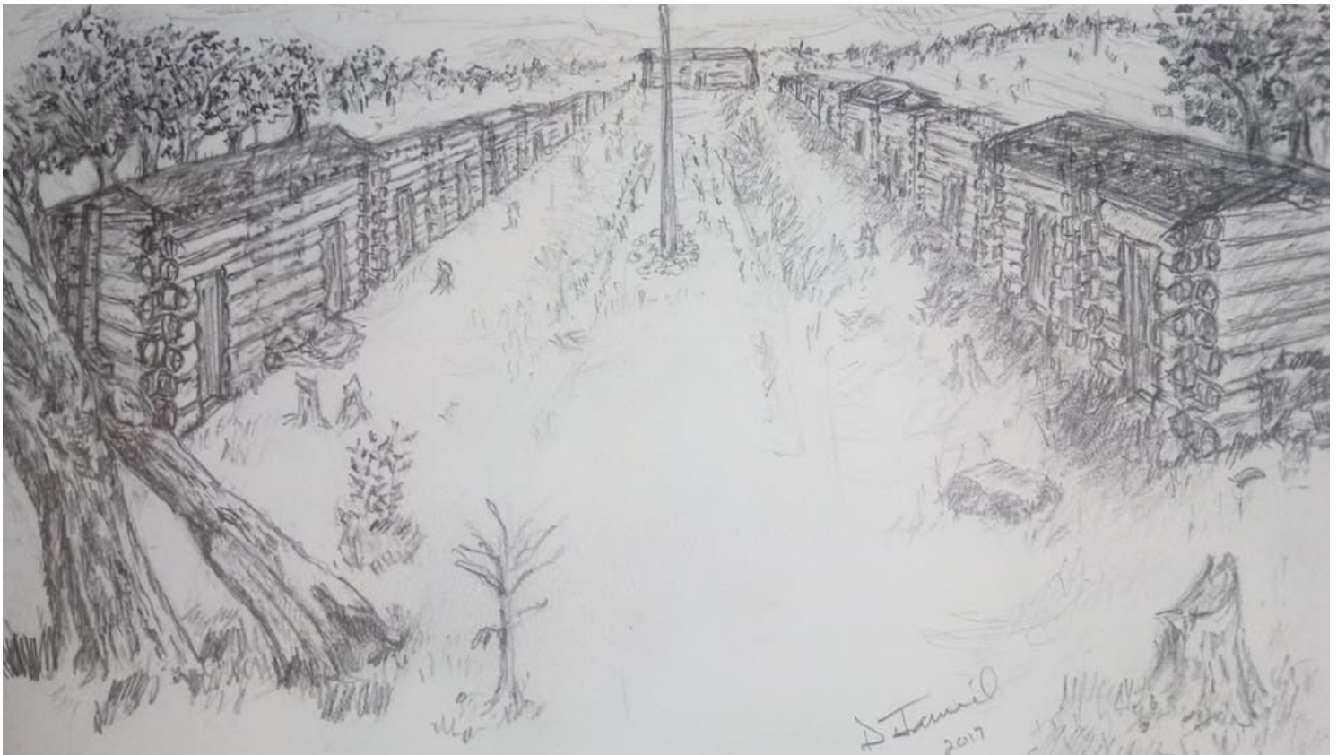
Sketch of Mormontown as interpreted by David Jamiel (2017); View is to the east with 'chapel' in background. The Arkansas River would be on the left (north) in this view. Ruxton related there were about 50 cabins in total which housed about 300 persons.

For more detail on the Mormon Battalion, go to https://mormonbattalion.com/ . To view the Thomas Bullock roster documenting those who arrived in the SL valley in July 1847, go to https://catalog.churchofjesuschrist.org/assets/ab774142-989d-4df6-a024-1f3a90e5bbd3/0/1 .